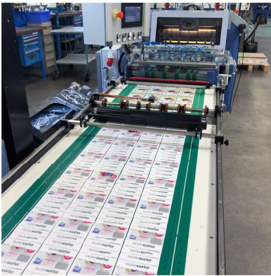
Vacuum belt for stable transport in a shingled stream or as individual products