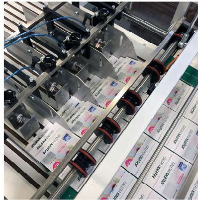
Guided product transport into the accumulative chute. Up to 5 streams