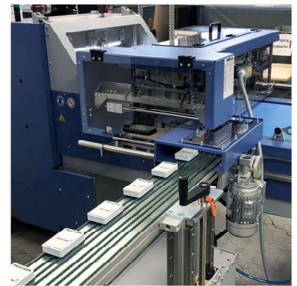
Transport the deck to downstream modules e.g. delivery belts, overwrappers, banding machines or similar