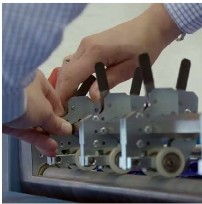
Short setup times, toolless adjusting