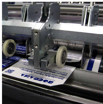
Break out elements for deflecting the waste matrix and delivering of the die-cut products