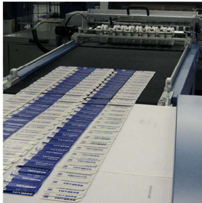
Direct delivery of the shingled products to the stream-spreading conveyor