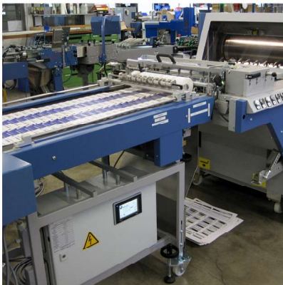
SB 550 Stream belt connected to BSR 550 Servo with new breakout unit