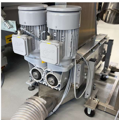
Option extraction unit