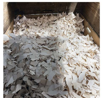
Reduced waste volume