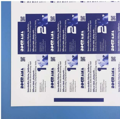
Printed sheet with print mark

A print mark reader can be used if the print image deviates from the leading edge of the sheet. It reads the position of the print mark and corrects in running direction. Register differences can thus be eliminated.