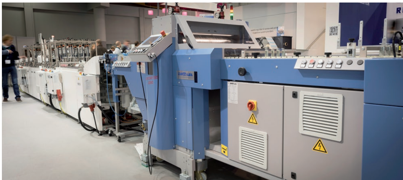
Packaging-Line „Stamina“, consisting of BSR 550 Servo with pallet feeder and Herzog + Heymann folding carton line.