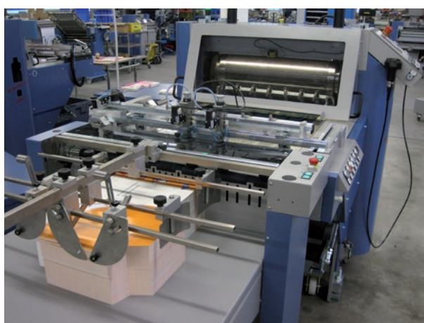
BSR 550 Servo combined with PST 750 pile stacker