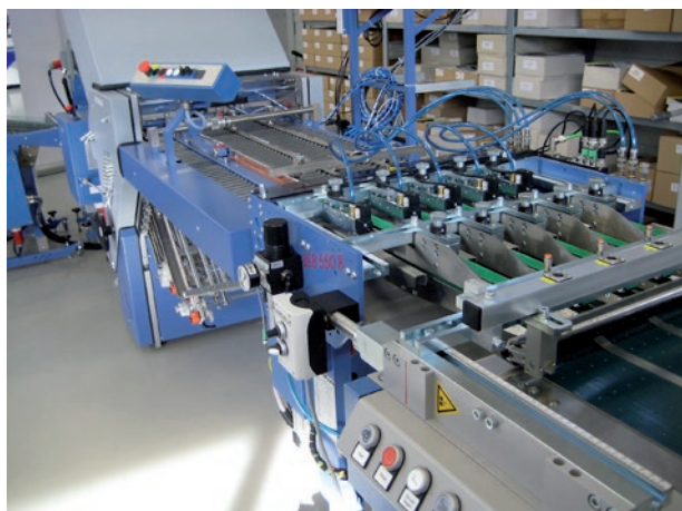
BSR 550 Servo combined with subsequent folding unit