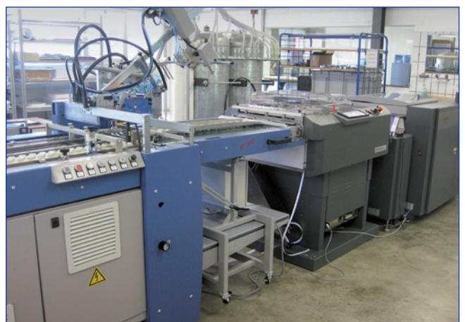
BSR 550 Servo with Tecna unwinder/cross cutter