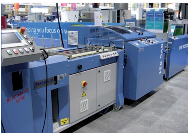
BSR 550 Servo with MBO unwinder and rotary cross cutter