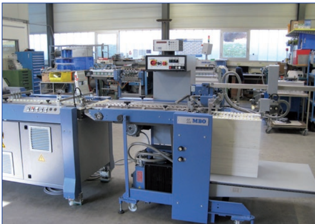
BSR 550 Servo with mobile flat pile feeder