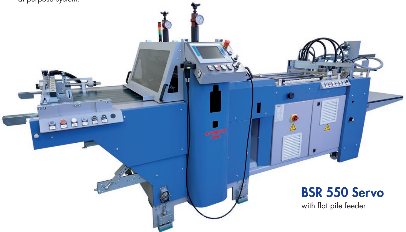
BSR 550 Servo with flat pile feeder