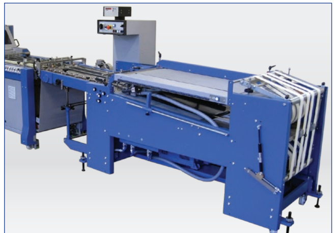
BSR 550 Servo with continuous feeder